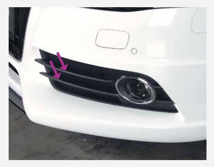
S-Line has two bars in the fog light cover.