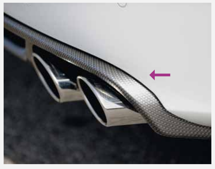
With non S-Line there is no light edge above the rear insert.