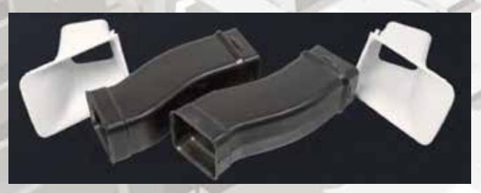
Air nozzles (white) and brake air ducts, required on vehicles before 09.87