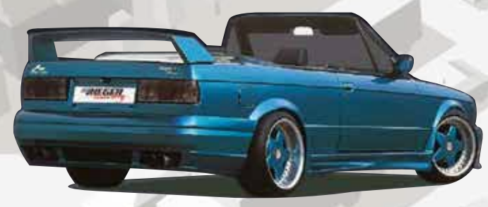
Rim no longer available