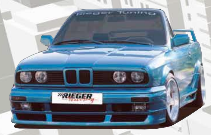
Wide kidney cover no longer available

The kit can basically be mounted on all BMW 3/1 from 09.82 and 3/R (convertible) from 03.86. For all BMW E30 models in 2- and 4-door. Version (without convertible), which were produced before September 1987, the wind deflector must be replaced, if fog lights are mounted. For the 3/R convertible, the wind deflector must be changed on vehicles produced before October 1990. Furthermore, brake air ducts, 2 fascias and 1 set of fog lights must be retrofitted. For clarification, these parts are shown below. The kit parts can also be used individually on the vehicle, e.g. spoliers or side skirts.